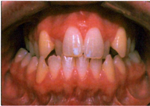
Problems with lip-seal